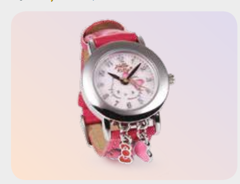
Hello Kitty QA Watch HKFR1405-05C Japan movement. Alloy case. PU leather strap.